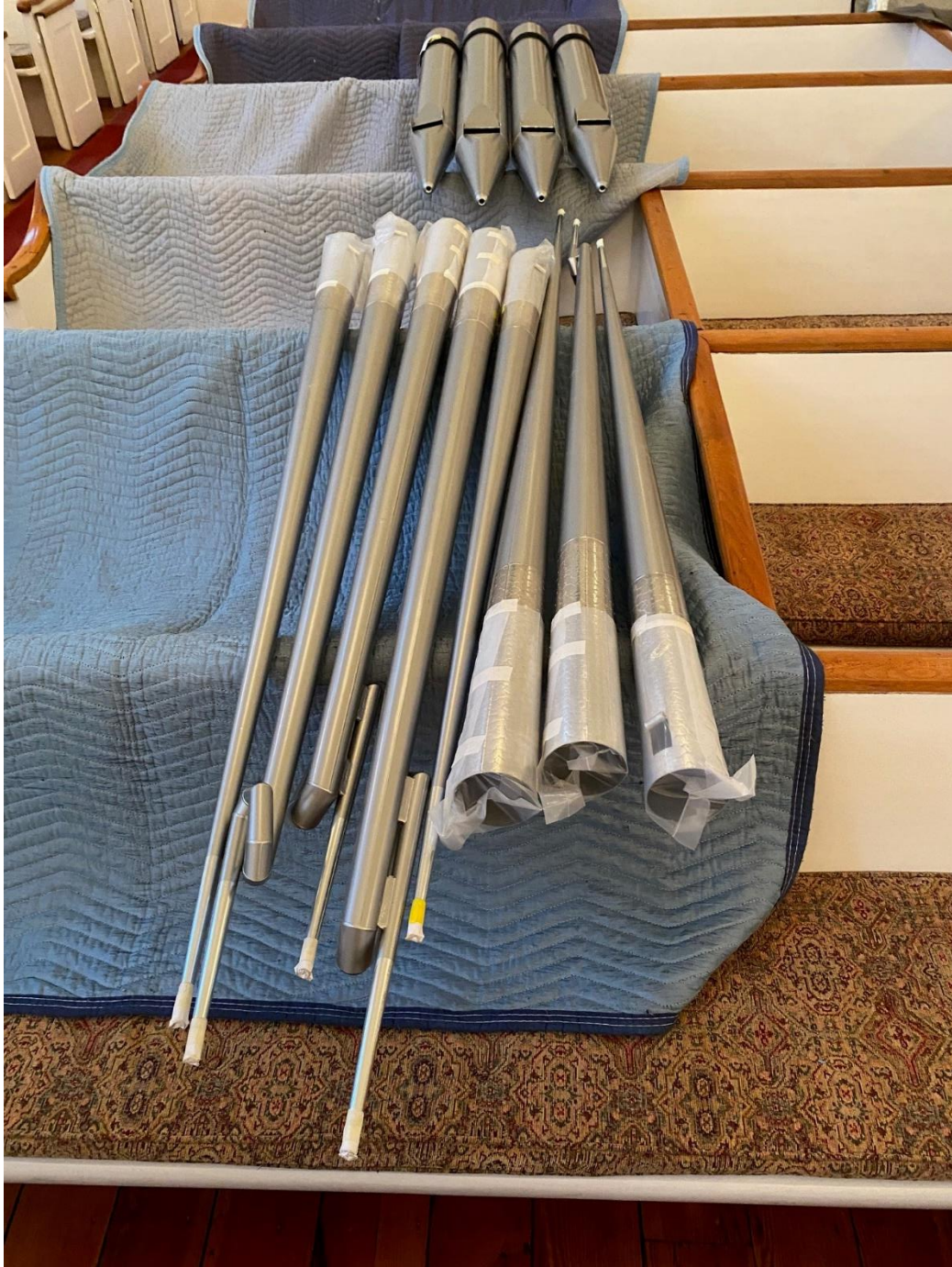
Trompette Harmonique pipes (and more flute pipes)