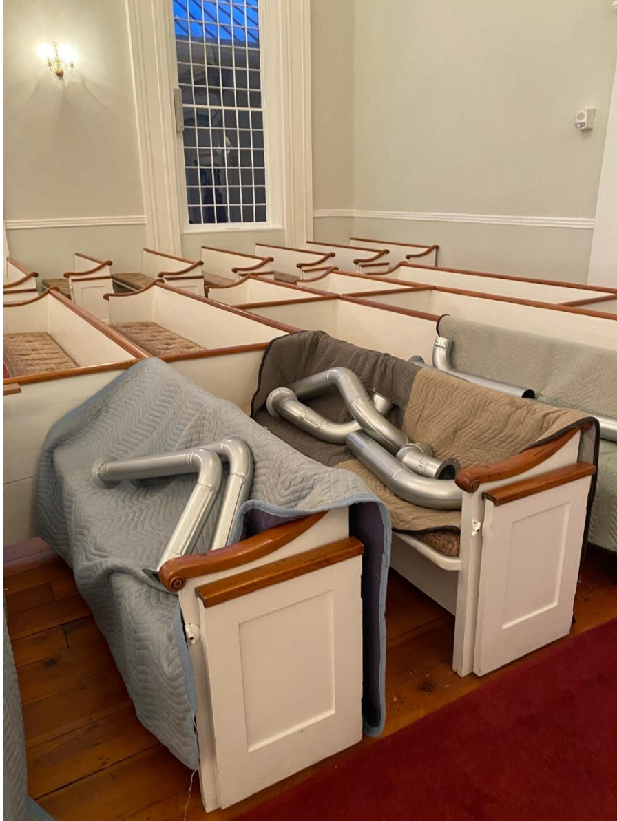
Ductwork to supply wind to the organ