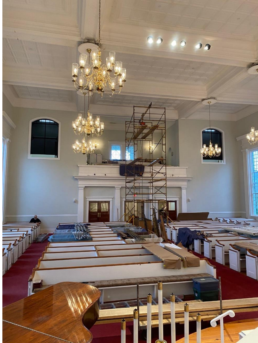
Scaffolding put up to get pipes and other parts up to the balcony