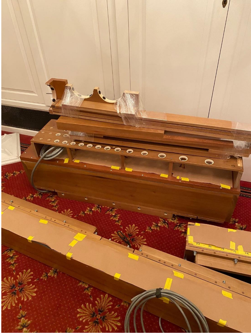
Windchests and racks for pipes